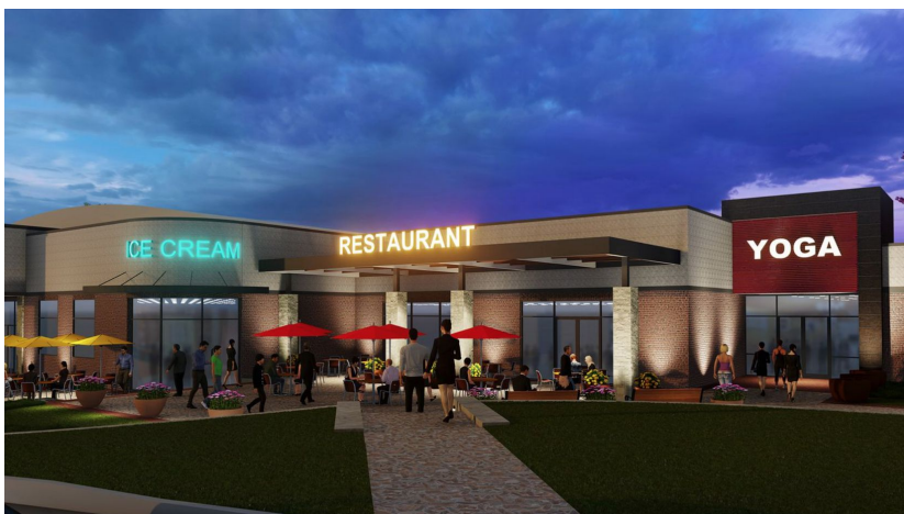
The 4315 Innovation Center is on Lancaster Road.

Mixed-use project on Lancaster Road is near VA Medical Center.